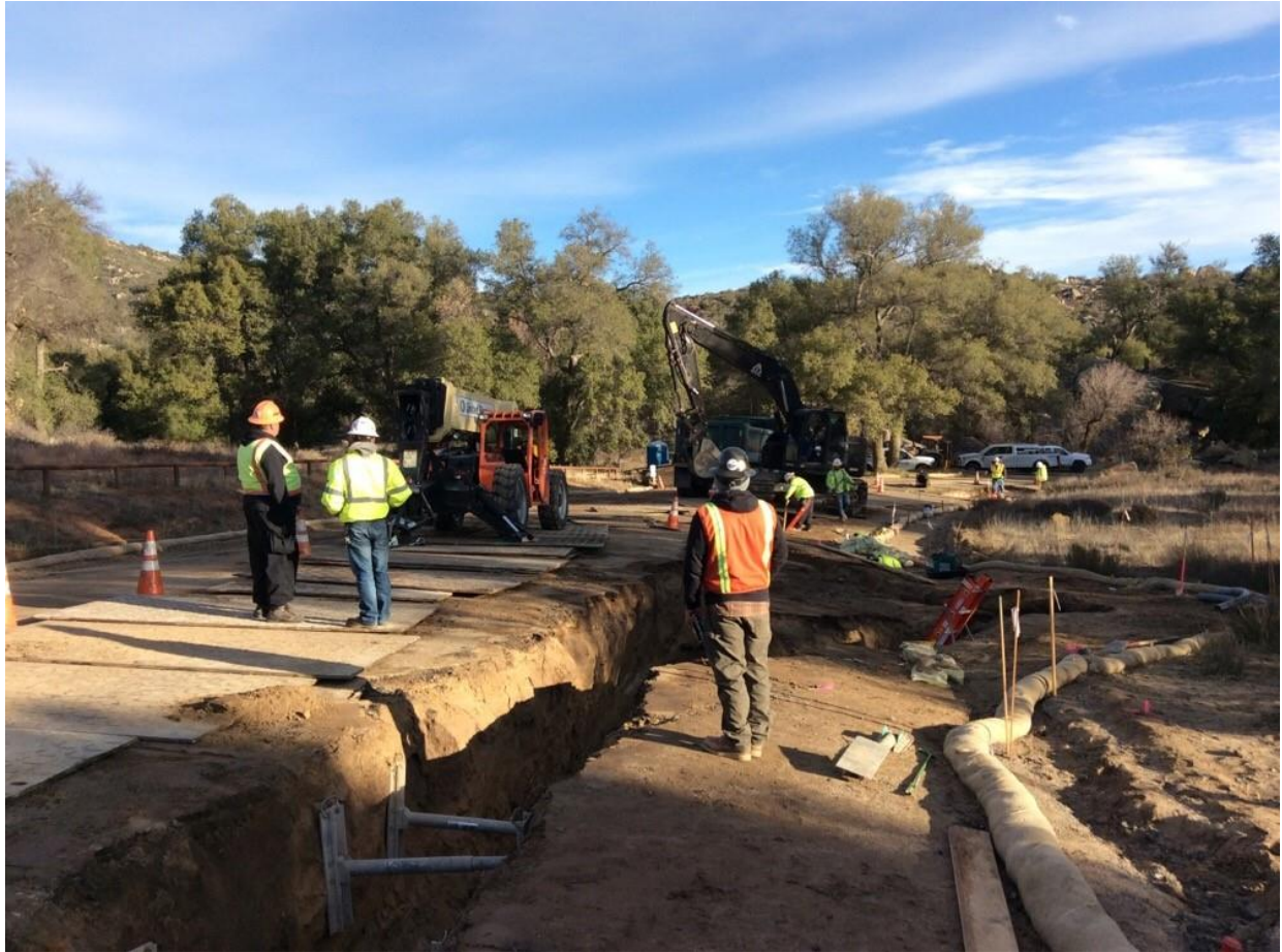
Photo 6: During trenching for the installation of underground conduit along C 449, biological, archeological, and Native American monitors were present in accordance with MM BIO-22, the HPMP, MM CUL-1, and APM CUL-04. Fiber rolls, installed as a sediment control BMP along the limits of construction, were observed in functional condition in accordance with the ECP, SWPPP, and APM HYD-09.