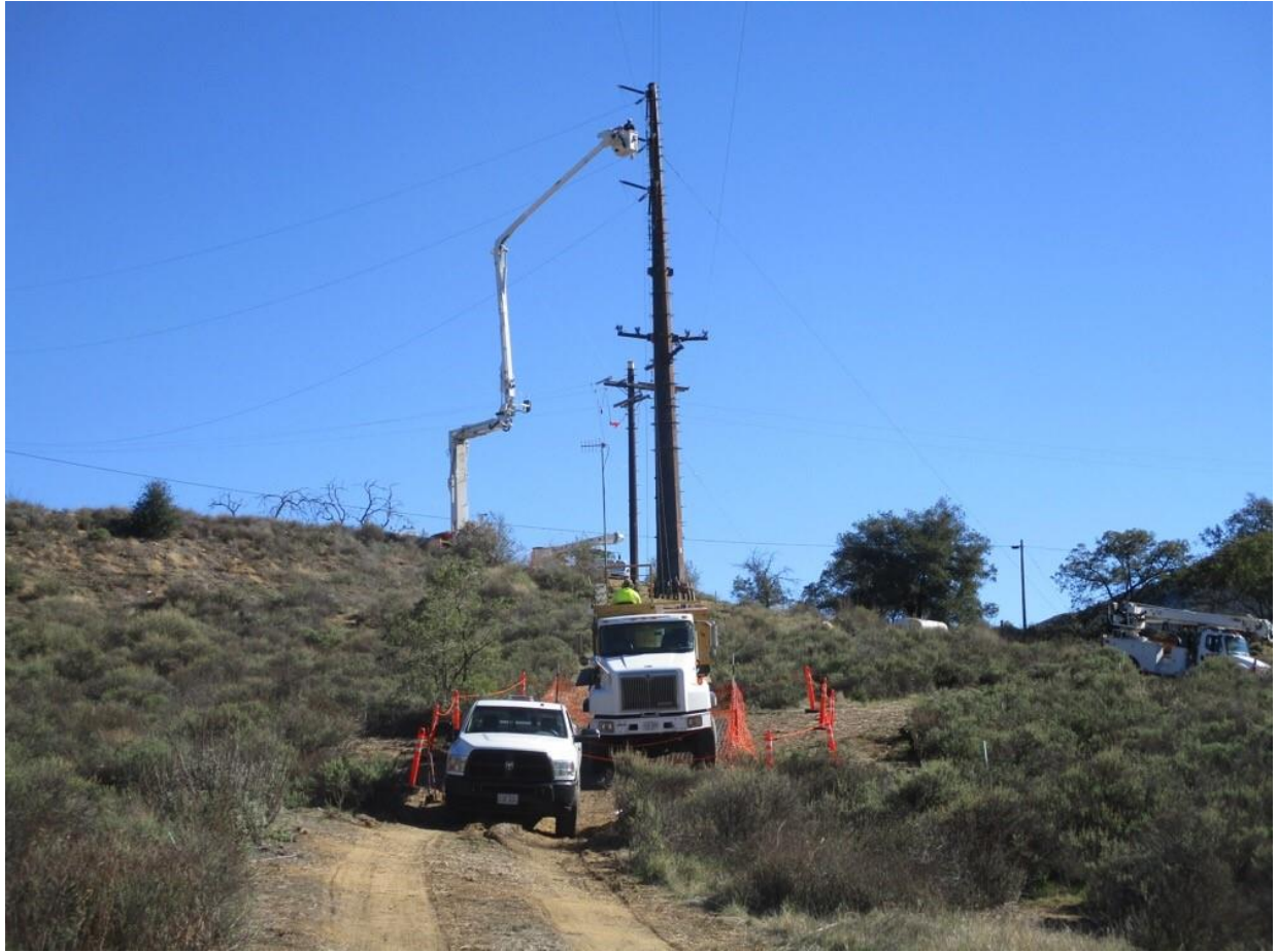
Photo 2: During 69 kV transmission line stringing operations at TL 682, a crew was observed sagging and dead ending wire at Pole Z118076 and the associated stringing site.