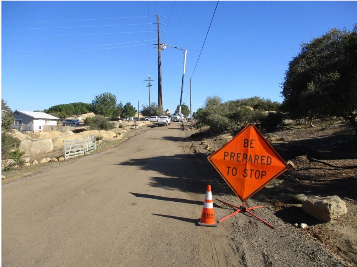
Photo 3: During 12 kV distribution line stringing activities along TL 6957, such as sagging and dead ending wire at Pole Z571424 (pictured), traffic notification signage was set out and traffic control personnel were observed flagging traffic around staged equipment along Carveacre Road in accordance with APM TRANS-02.