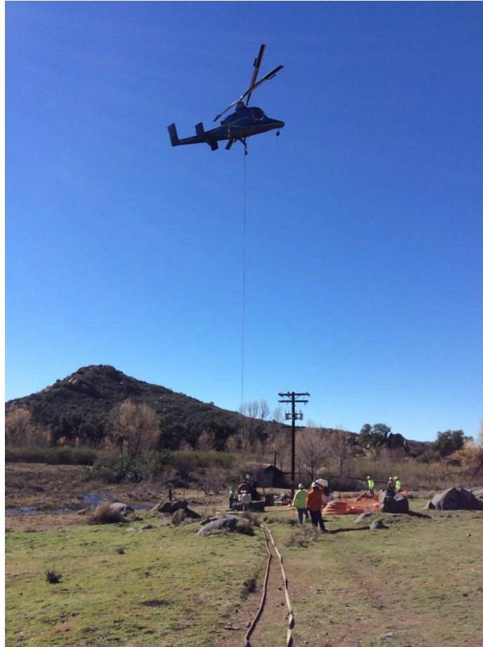
Photo 5: During pole hole excavation and anchor hole backfilling at Pole P278750 (C 157), a helicopter was utilized to transport equipment to and from the remote site using helicopter external load operations in accordance with the Aviation Safety Plan and MM PHS-5.