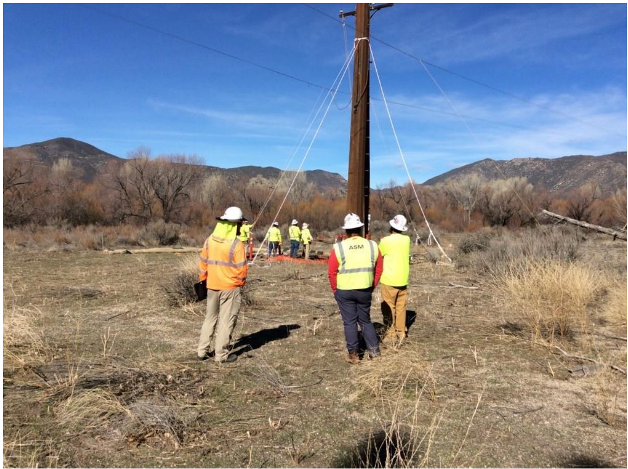
Photo 1: During pole setting at Pole Z100055 (TL 629C), biological, archeological, and Native American monitors were present in accordance with MM BIO-22, the HPMP, MM CUL-1, and APM CUL-04.